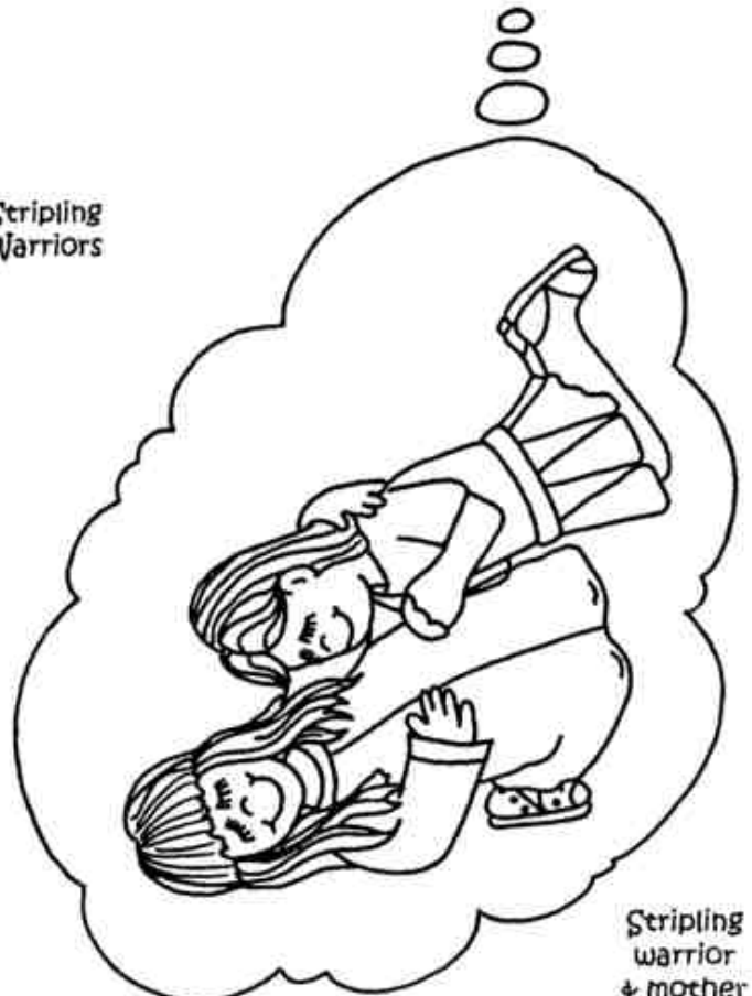
Stripling warrior + mother